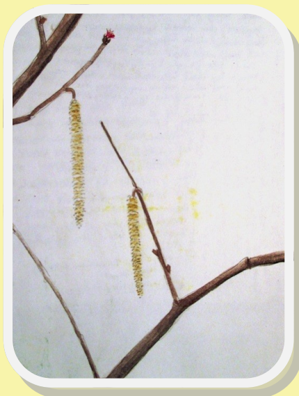
American Hazelnut, Corylus americana