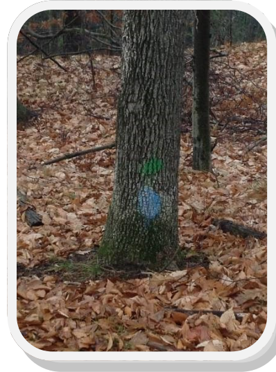
An ash tree treated in 2011 and 2014 with Tree-Age pesticide to protect against the Emerald Ash Borer.

effects of the Emerald Ash Borer beetle. The grants allowed treatment of 20 of the Institute's ash trees with Tree