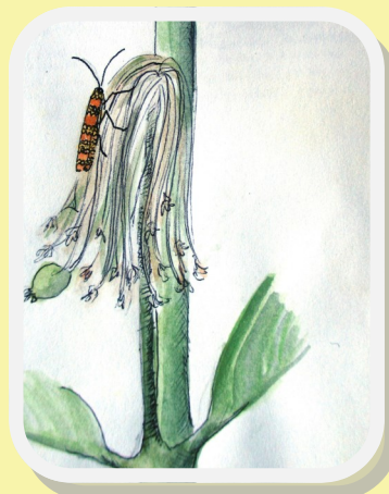
Common Milkweed, Asclepias syriaca