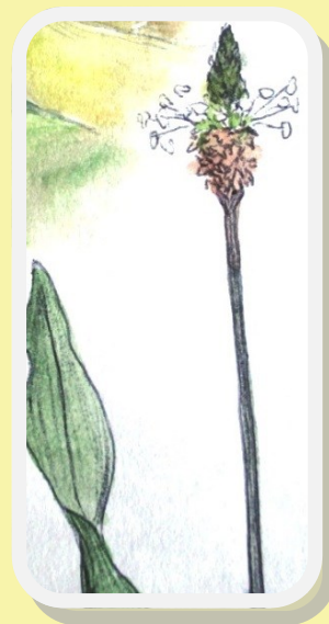
Ribwort Plantain, Plantago lanceolata