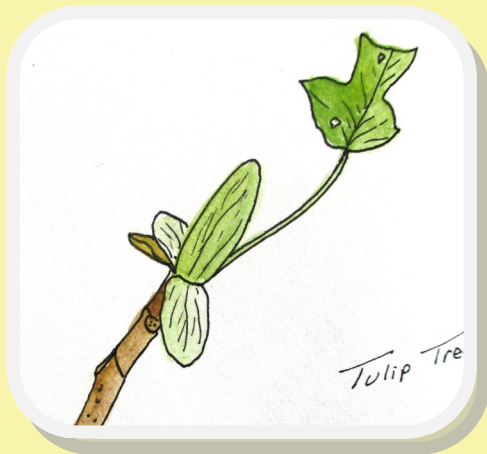
Tulip Tree, Liriodendron tulipifera