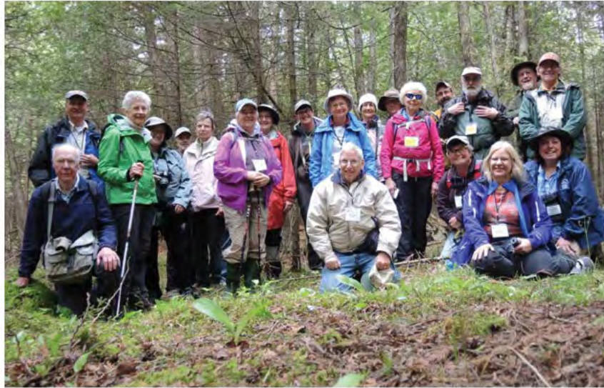
Orchids and Wildflowers field trip.