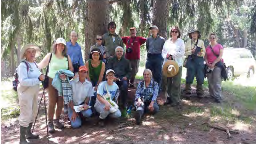
Shiawasee Basin Preserve Field Trip.