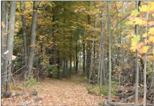
Photos: Pierce Cedar Creek Institute Trails, www.cedarcreekinstitute.org/