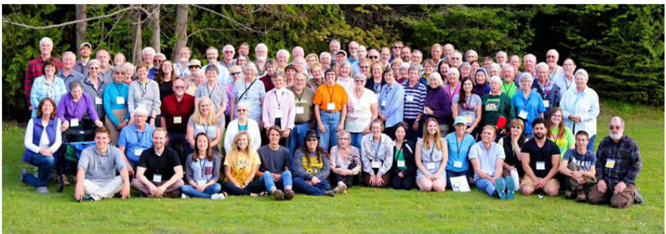
2017 Foray Attendees