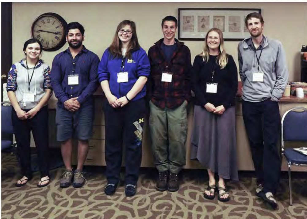
Alumni sponsored students, 2017