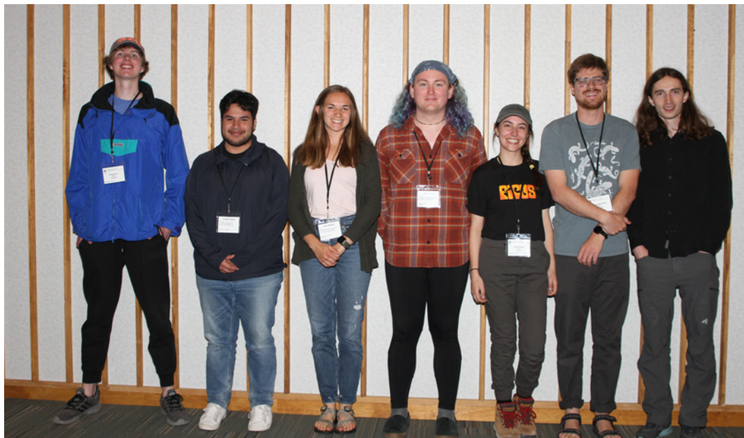
2022 Foray Sponsored Student Attendees