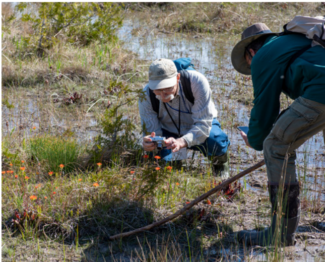
Thompson's Harbor Field Trip