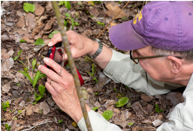
Dan Skean photographs Cypripedium arietinum