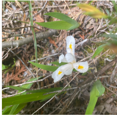
Iris lacustris, forma alba