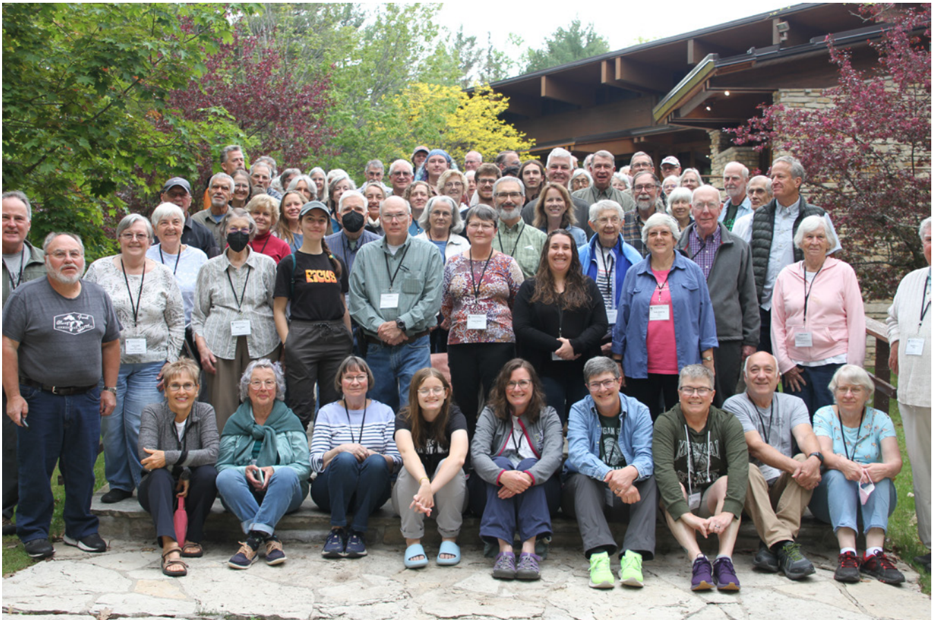
2022 Foray Attendees